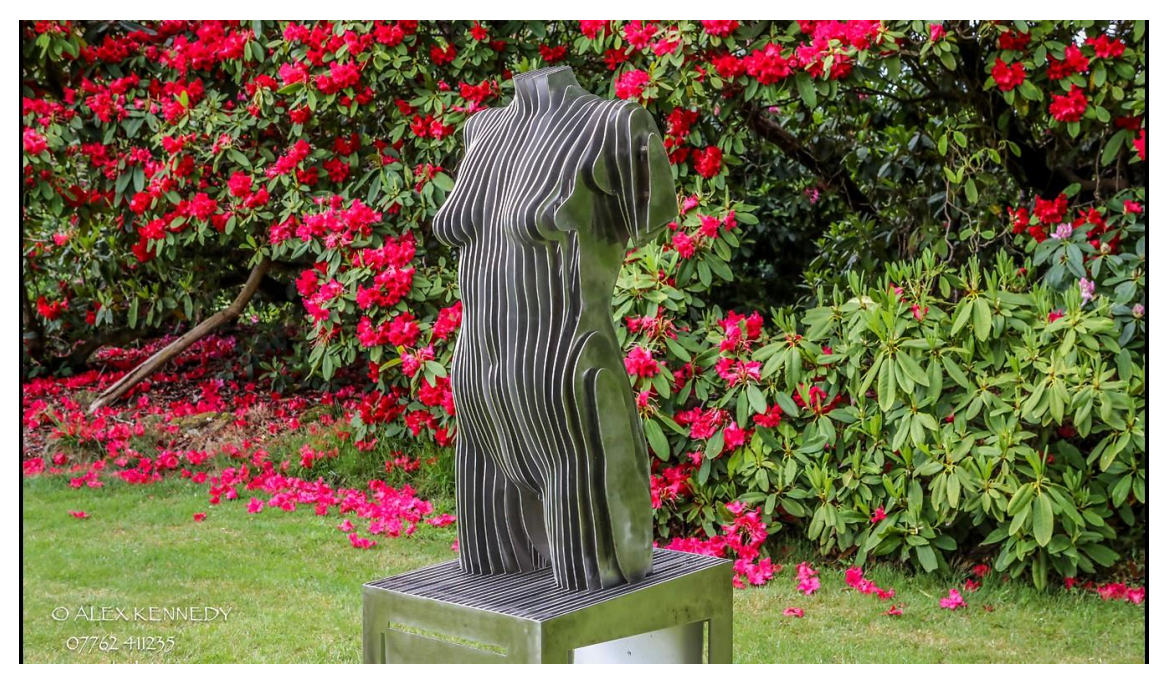
'Chinese Whisper' 145cm x 42cm x 42cm (inc base). Stainless steel. Edition of 5.

This sculpture is made by 3D scanning the form so that I have the information electronically which I can then slice up into layers, and assemble in a way that suggests the spaces in between. It is the layering and the spaces the particularly interest me.