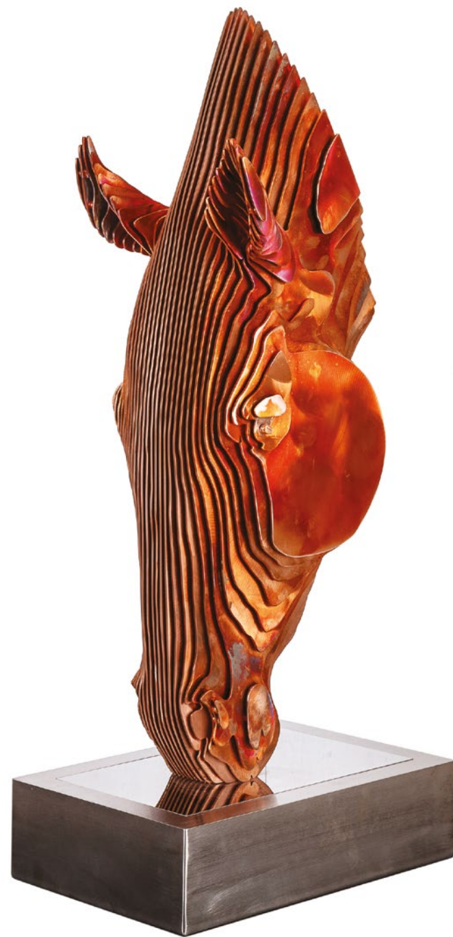
Caballo Bebedor II 2021 Copper on polished steel on stainless steel base 60 × 30 × 20 cm. Edition of 8.