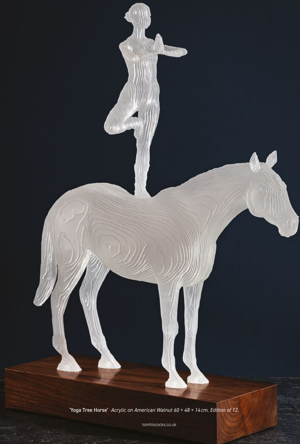
'Yoga Tree Horse' Acrylic on American Walnut 60 × 48 × 14 cm. Edition of 12.

Both of these sculptures are made in clear acrylic and stand on beautiful American Walnut bases. They are suitable for showing inside.