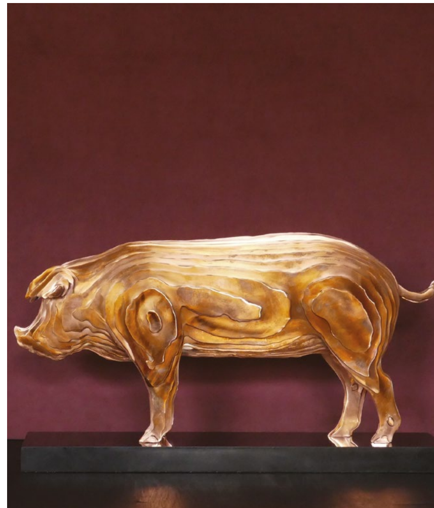
MRS PIG II Copper 50 × 25 × 12 cm. Edition of 8.

I was walking with some friends along the canal from Great Bedwyn in Spring 2021, and we passed a field where there were three Tamworth sows. I was reminded that there is something majestic and wonderful about all pigs, but these in particular.