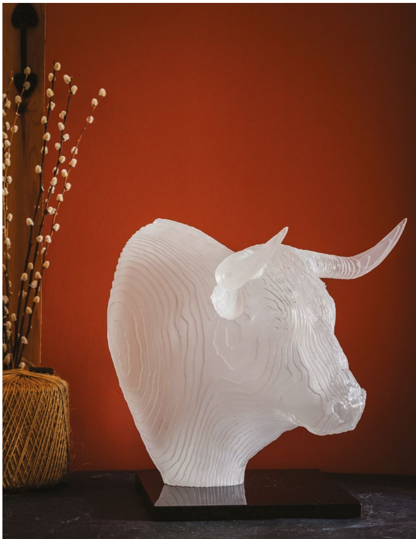
EL TORO I Acrylic on granite 40 × 38 × 38 cm. Edition of 12.

I remember as a child reading 'The story of Ferdinand', a 1936 book that tells the story of a Spanish Bull who would rather smell flowers than fight in bullfights.