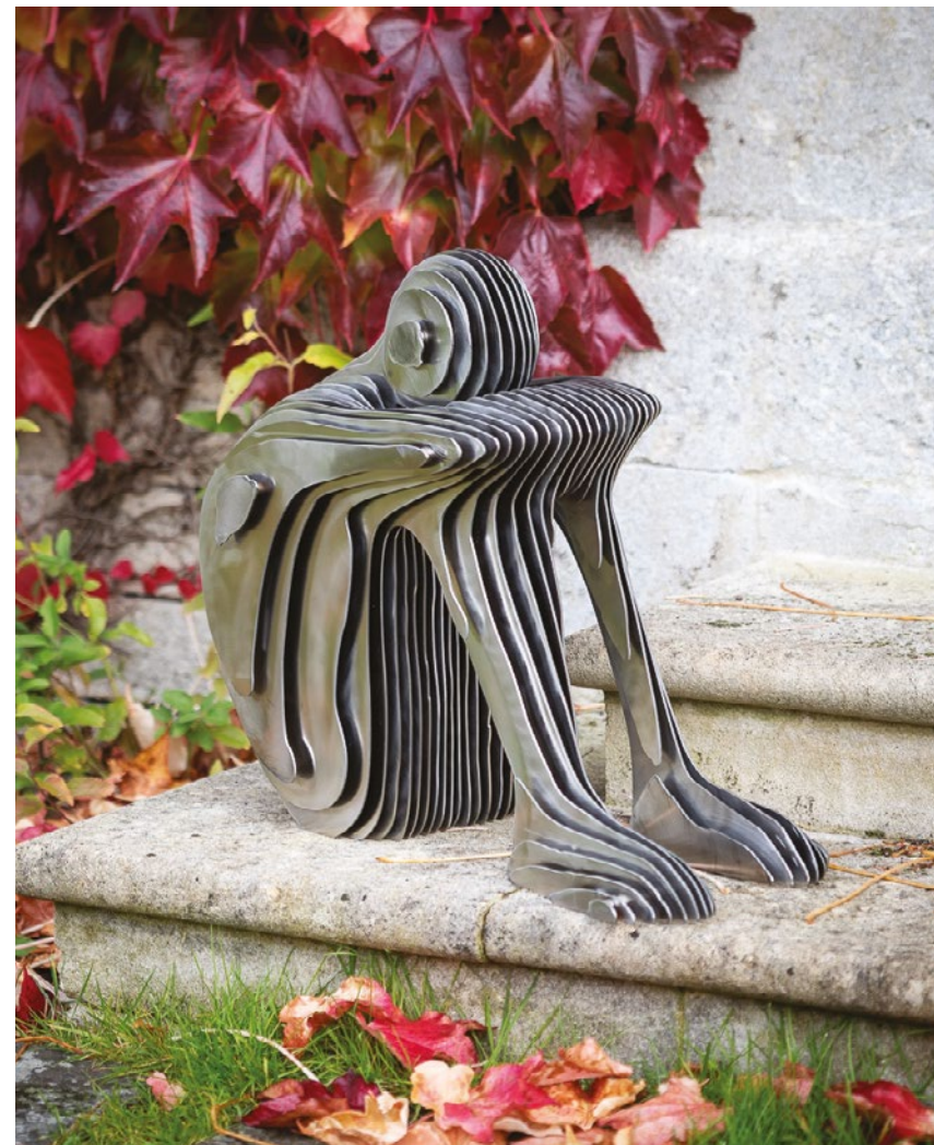
ONE VII Stainless steel 44 × 51 × 24 cm. Edition of 12.

The form for 'Contemplation' took its initial shape in 2014, and has evolved more recently. It is made in layers of 3mm copper, and sits on a rough block of Portland stone. There's a 360 video on my website if you want to see it 'in the round'. This sculpture is suitable for showing inside or outside, and it could be scaled up to suit a particular space.