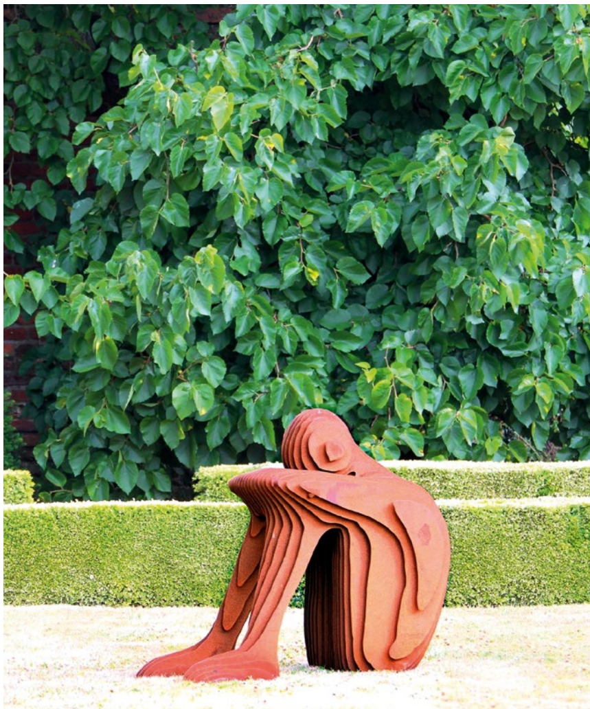
Many Become One Corten steel 105 × 96 × 46 cm. Edition of 5.

'I am profoundly touched by this sculpture every day. To have produced an object in such a hard and severe material as Corten steel that glows with feeling and emotion is quite remarkable and shows the unique skill that Tom has.' (Leicestershire, UK)