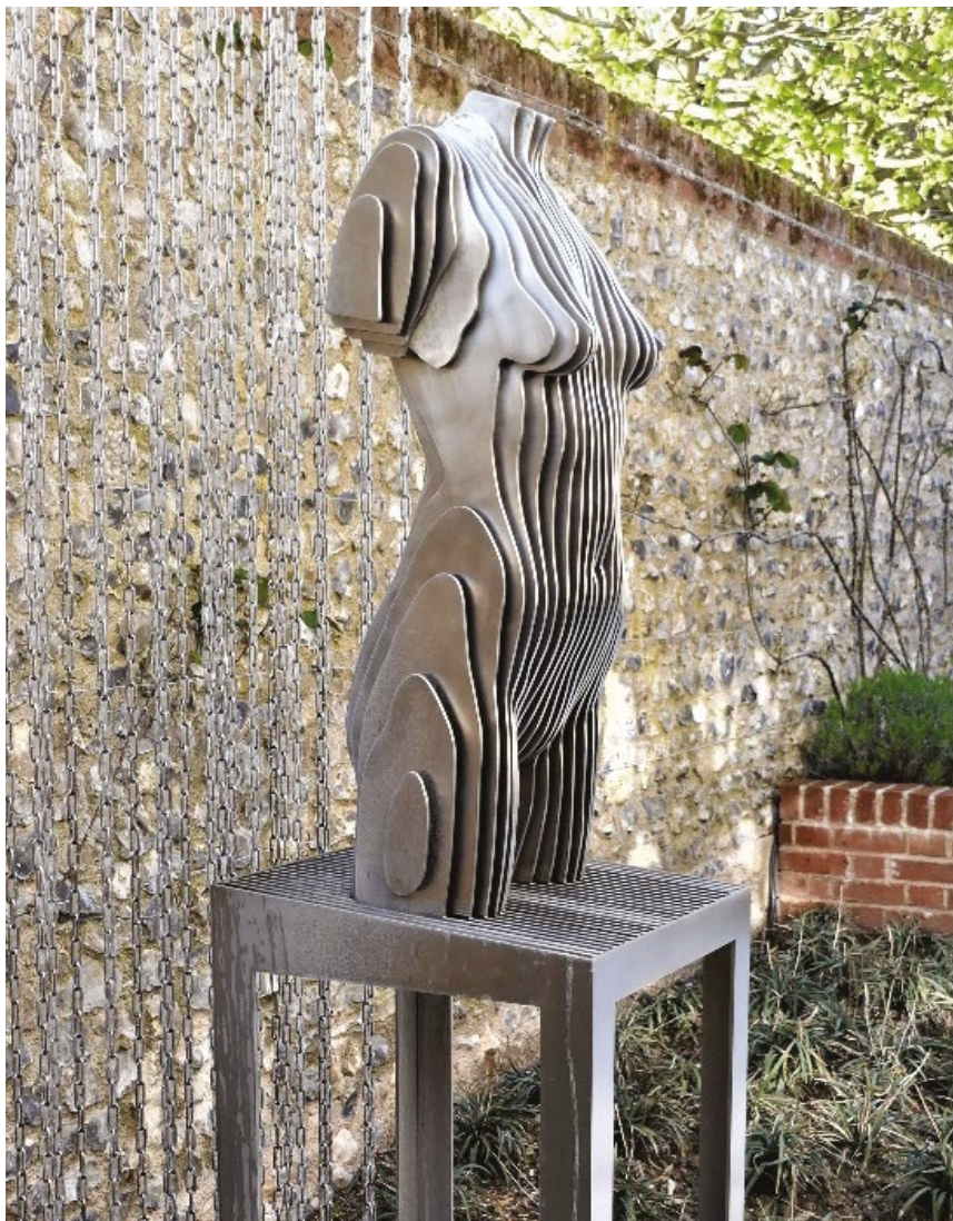
Female Torso Marine grade stainless steel 195 × 42 × 42 cm.

I have created this beautiful form in various materials and was delighted to be commissioned to create the stainless-steel version here as a feature within a particularly stunning garden. The designer placed chains behind, with water running down which provides a wonderful backdrop.