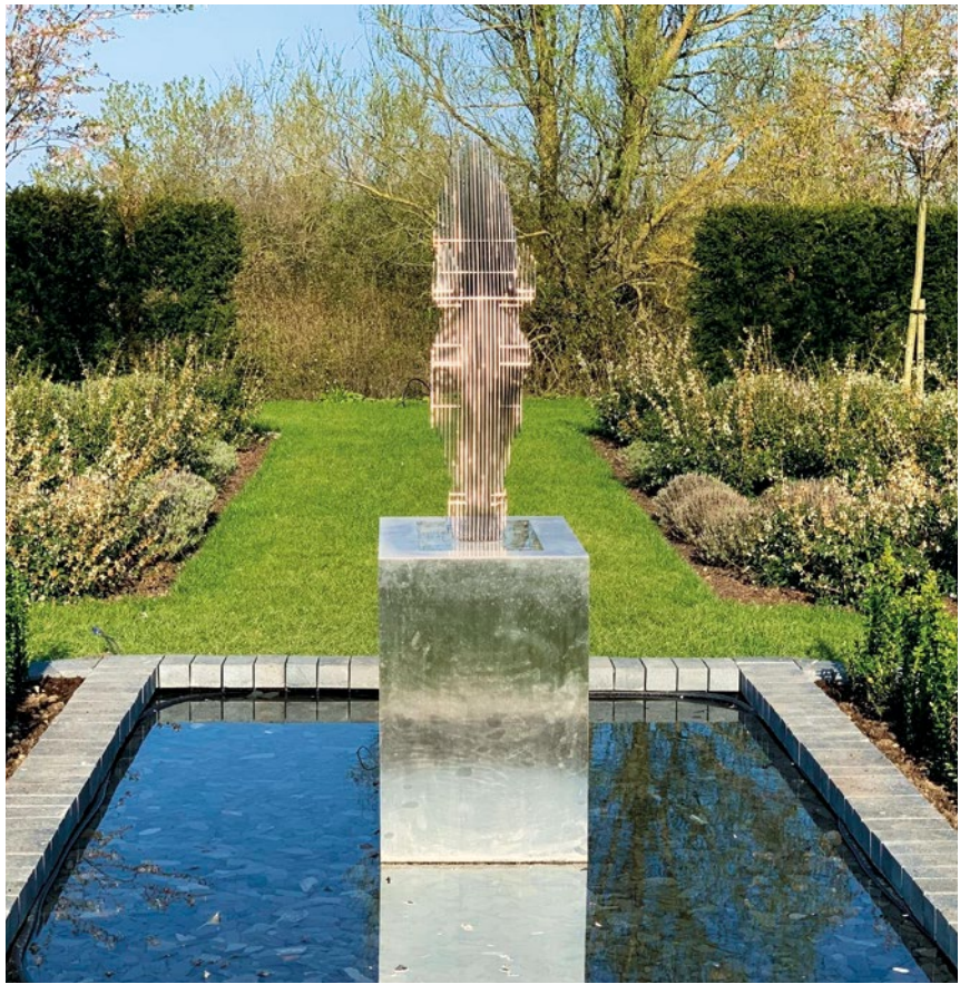
Drinking Horse VI Stainless steel 175 x 50 x 80 cm. Edition of 5.

This is the completed version of the sculpture I was making on the inside front cover of this compendium, shown here installed at a wonderful client's home.