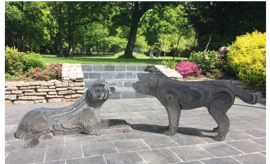
'Digby & Althe 2020' Stainless steel, life size. 316