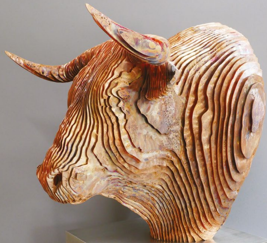
EL TORO II. Copper on 1 metre tall stainless steel base 65 × 61 × 61 cm. Edition of 5..

El Toro II is suitable for showing either inside or outside.