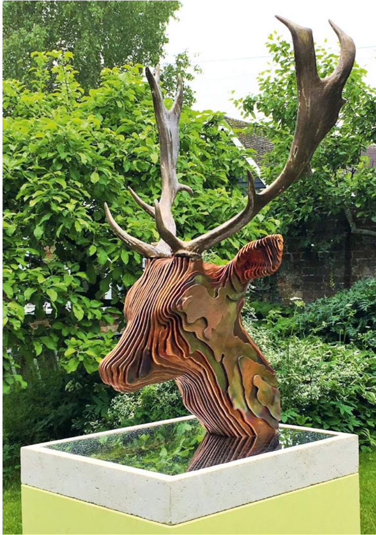
'Fallow Deer' Copper on stainless steel on Portland stone 52 × 37 × 34 cm. Edition of 8.

I made Fallow deer to coincide with the 2018 Garsington Opera season which is housed at Wormsley Park in Buckinghamshire. Apart from many other beautiful things, the estate is renowned for its herd of deer. I collaborated with a taxidermist to give me an understanding of the exact form of this elegant animal, and using my process of scanning and slicing to make this sculpture in copper, stainless steel and Portland stone. This sculpture is suited to being shown indoors.