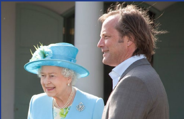
In conversation with Her Majesty The Queen at the unveiling of my work at Valentine's Mansion, Ilford during the Queen's diamond jubilee tour.