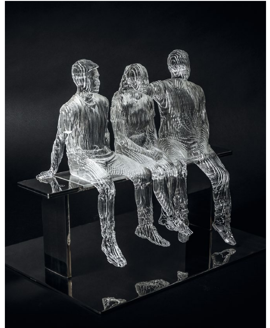
Gang of Three Acrylic on stainless steel base 42 × 40 × 56 cm. Unique commission.

The materials are important to my work, and the physicality of the making process also brings its own resonances. I start with the traditional sculpting process in wax or in clay, then I use 3D scanning; computers and laser cutting alongside welding and polishing to create the final sculptures.