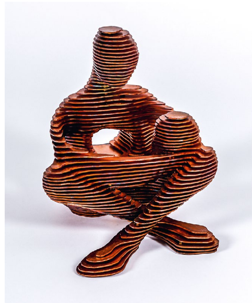
TWO III Copper plated mild steel 20 × 30 × 30 cm. Edition of 8.

'I am profoundly touched by this sculpture every day. To have produced an object in such a hard and severe material as Corten steel that glows with feeling and emotion is quite remarkable and shows the unique skill that Tom has.' (Leicestershire, UK)