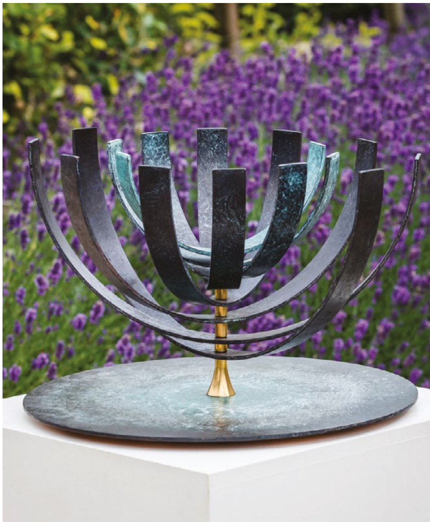
OCTAVE FLOWER Phosphorous Bronze and brass 30 × 52 × 52 cm. Edition of 5.

I created Octave Flower as part of my enquiry into the philosophy of the octave, and the laws of nature. The 8 elements are sized according to the maths of an octave, and each rotates independently on the vertical axis so that there are an infinite number of arrangements in which it can be viewed.