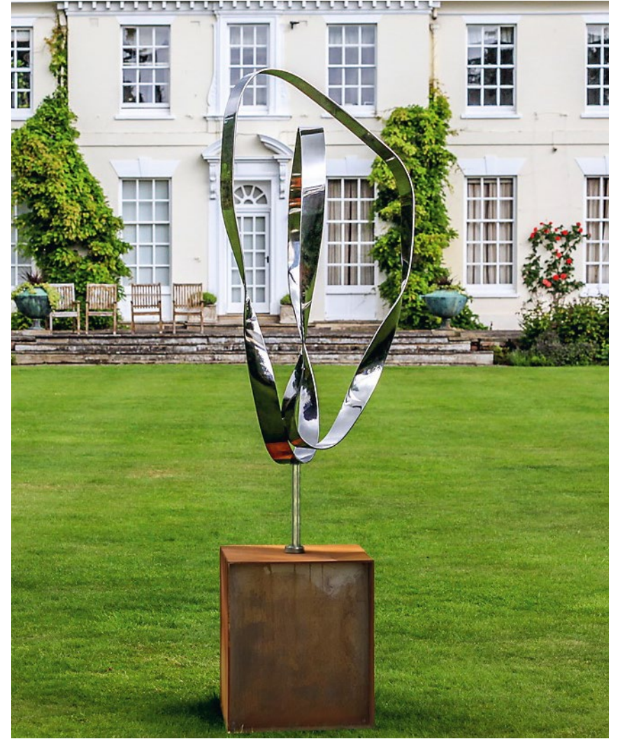
KISS II Stainless steel on corten steel base 3 metres × 75 cm × 85 cm. Edition of 5.

I made Fallow deer to coincide with the 2018 Garsington Opera season which is housed at Wormsley Park in Buckinghamshire. Apart from many other beautiful things, the estate is renowned for its herd of deer. I collaborated with a taxidermist to give me an understanding of the exact form of this elegant animal, and using my process of scanning and slicing to make this sculpture in copper, stainless steel and Portland stone. This sculpture is suited to being shown indoors.