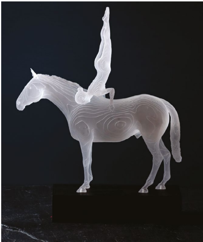
Girl in Dark Glasses Acrylic on American Walnut 57 × 48 × 14 cm. Edition of 12.

When I was younger, I used to do head stands on horses as a way of building mutual trust, so when I saw an image of a friend of mine doing the same thing recently, I took it as a challenge to represent that relationship. I hope the result captures something of that mutual trust, as well as the elegance of both horse and rider.