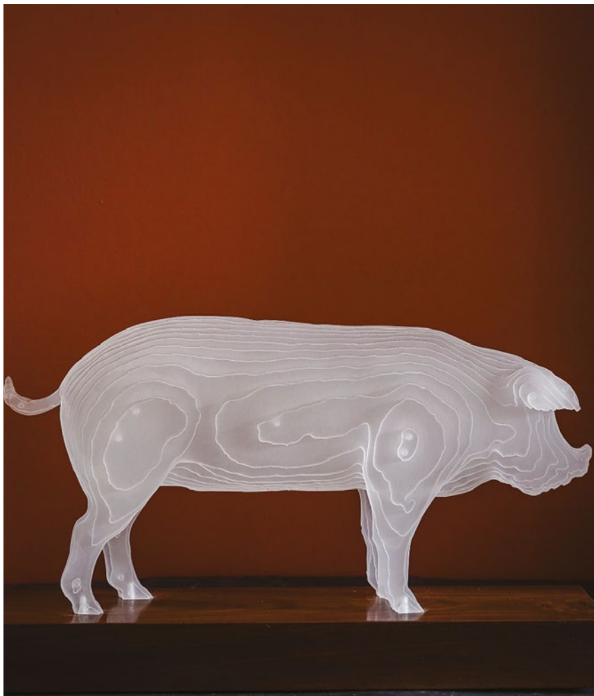
MRS PIG I Acrylic on American Walnut 50 × 31 × 14 cm. Edition of 8.