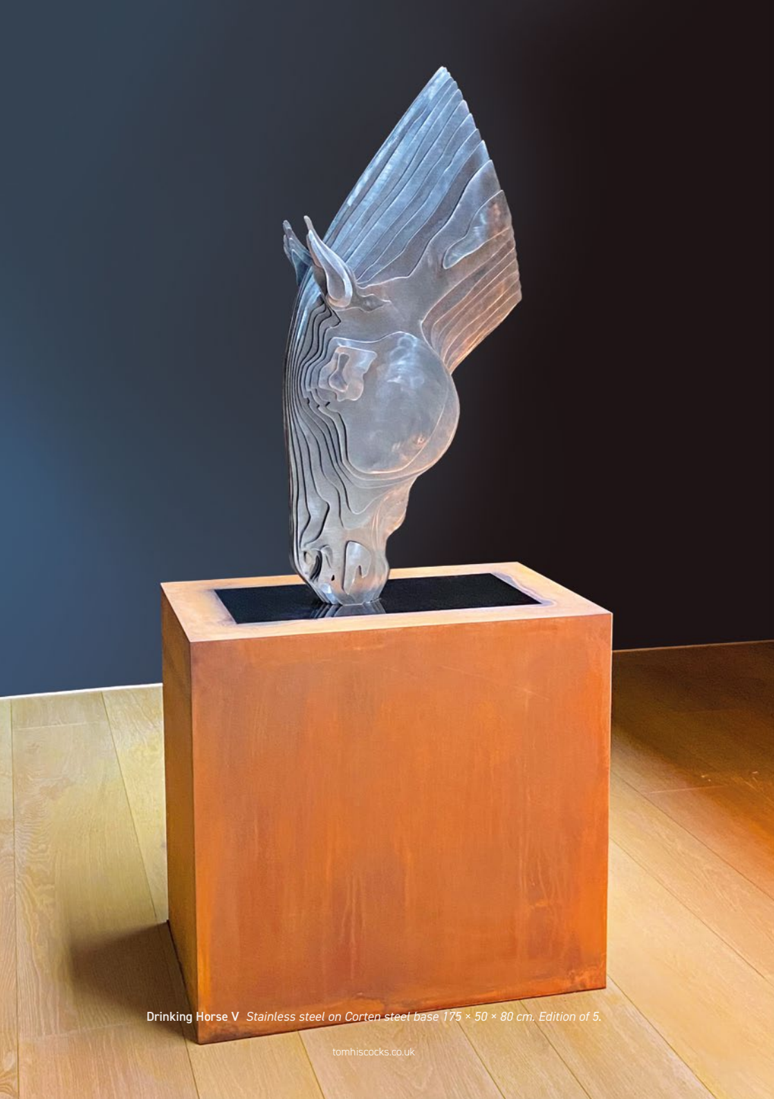
Drinking Horse V Stainless steel on Corten steel base 175 x 50 x 80 cm. Edition of 5.